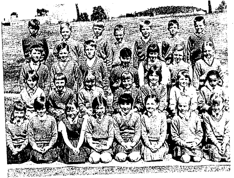
THE JUNIOR CHOIR