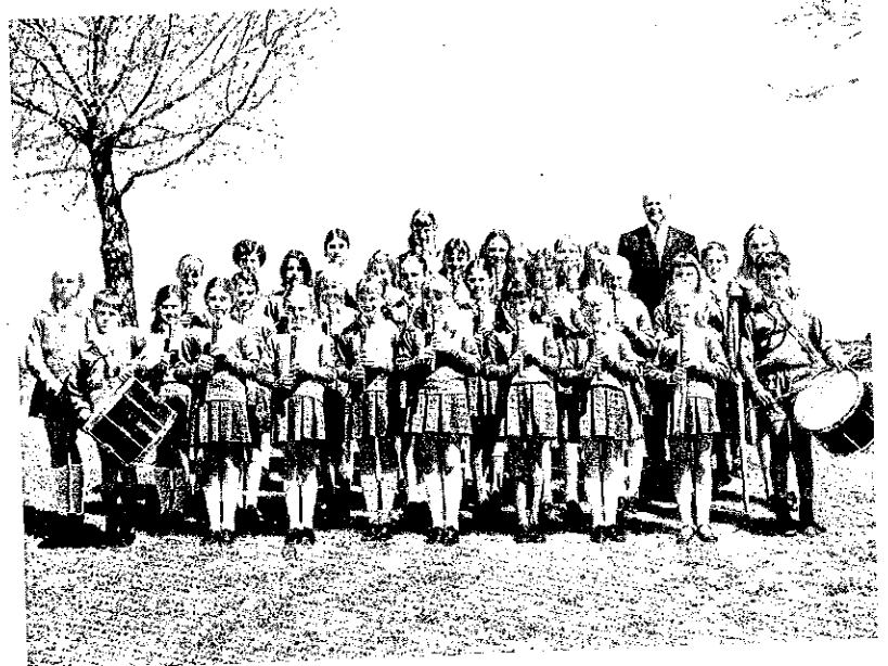
THE SCHOOL BAND